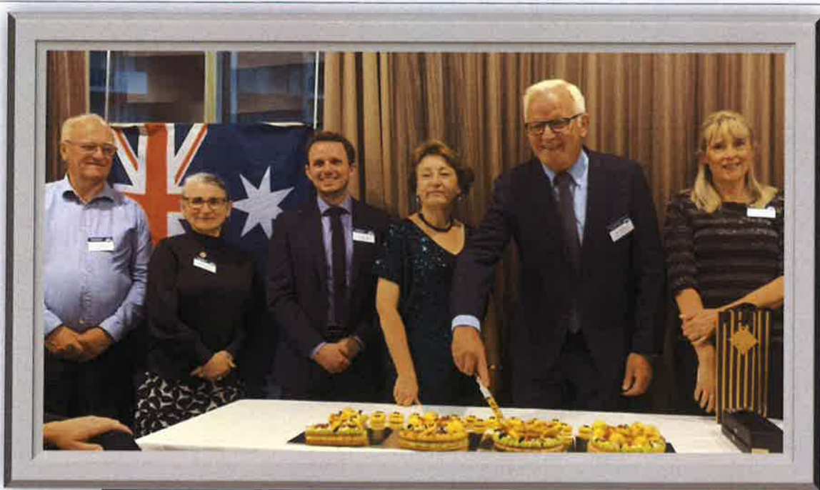
Above: Some members of the current Executive cut the cake