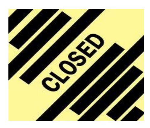
Holiday in Victoria for Melbourne Cup Day

Whipping up a storm was Suben Subenthiran who came last in the Melbourne Cup as a horse. This was due to the fact that when Suben arrived in Australia he had no idea what the Melbourne Cup was. He was actually dumbfounded by the fact that it was a public holiday in Victoria!