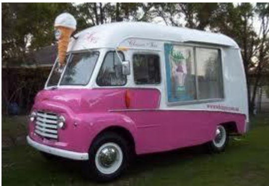
"Greensleeves" played by ice cream sellers