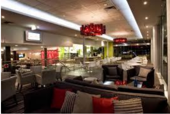
Stay for a drink and a chat at Parramatta RSL Club