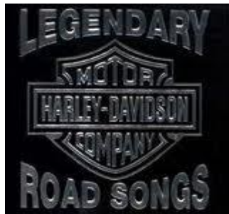
sweet sounds of music!