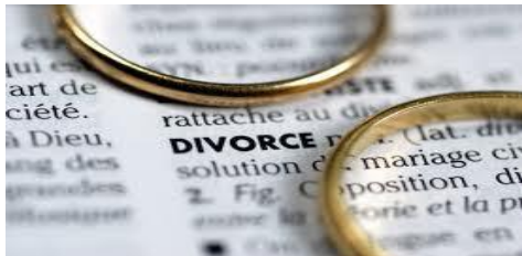
packages for divorced men seeking financial closure