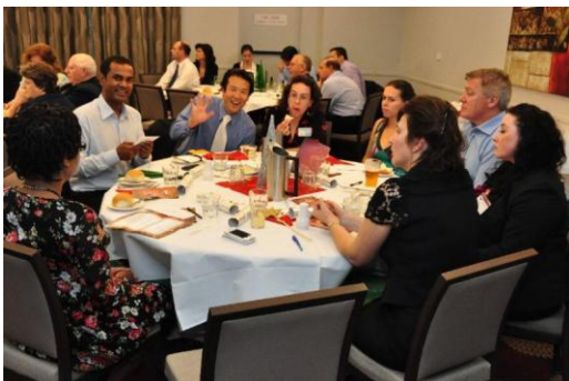
Guests and Toastmasters enjoying themselves