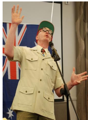
What's up there?