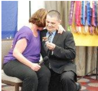
"Will you marry me?"