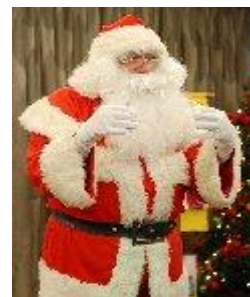
Santa in action

Ho, ho, ho yelled Santa . He shared many stories with us including the 95 year old lady who wanted to cuddle Santa - it was her only wish, one which Santa granted. Just shows you that Santa will always be in our hearts. Merry Christmas to you too Santa, we all love you!