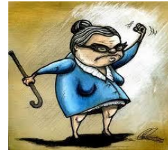
and the old lady