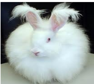
I'm not ferocious, I'm warm and friendly!