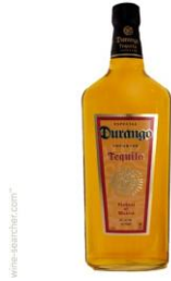
bottle of tequila