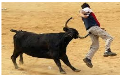
or perhaps move it out of the way eh John?