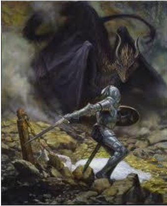
good overcoming evil