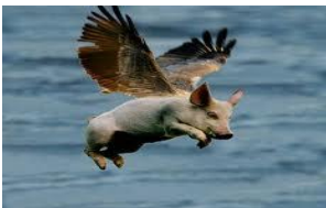
Pigs are great entertainers