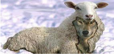
A sheep is intelligent! Oh yeah!!