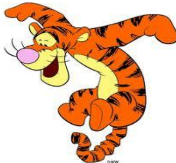
A tiger jumps on everything!