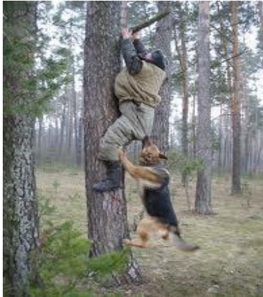
dog is a man or womens best friend (hmm!)