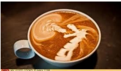
Dragon coffee anyone?