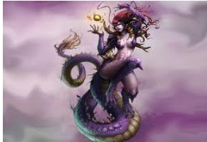
Back to you Madame Dragon!