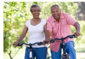
Thank you Senior Citizens – you deserve to be treated kindly