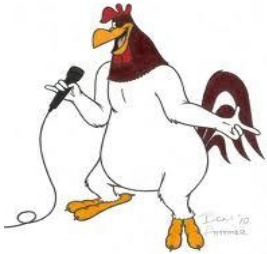
Cockle Doodle Do – I am your leader!