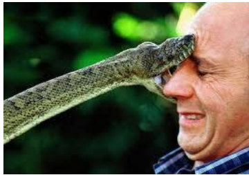
A snake knows what we need! Really?