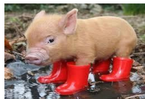
- not sure if I'd want to be in your shoes David!