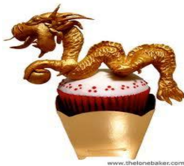
howabout a Dragon cup-cake?