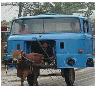
An Ox always pulls its load