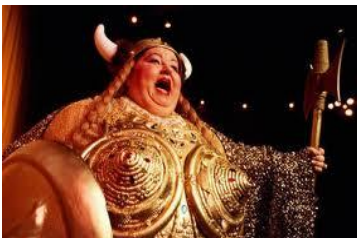
No opera meetings here!