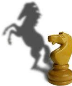
Learn to really listen to your evaluation to help you be great!