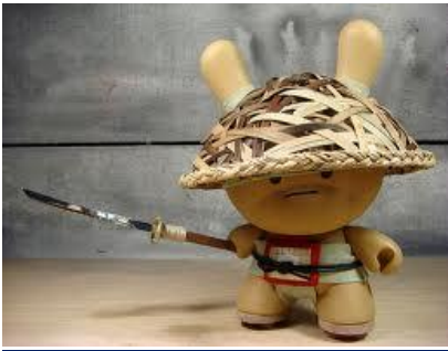
Be fearless, do a Speechcraft Course!

If you are interested in the Speechcraft Course run by Parramatta Toastmasters Club please go to – http://www.parramattatm.org.au/speechcraft.htm