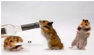
Rats are rather charming