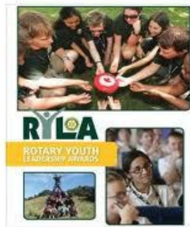
RYLA is inspirational