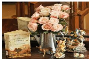
This book is a fairytale for grown ups