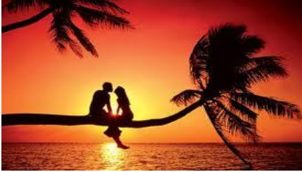
love came along – in the whisper of the trees