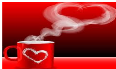
Love a cuppa anyone?