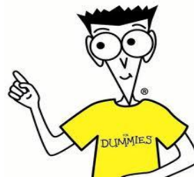
Twitter for Dummies