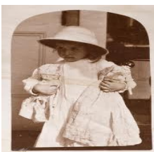
A lost child