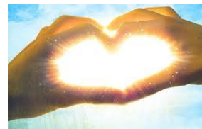
Love is our true nature