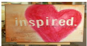
A very heart warming inspirational