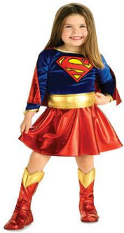
Why can't I be superman