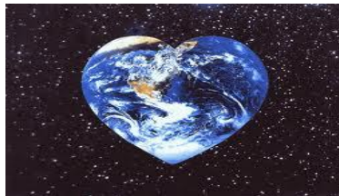
Love Tanzania and the world