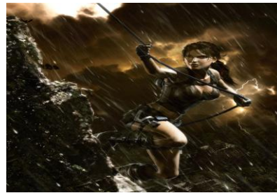
Kirisha the new Tomb Raider!