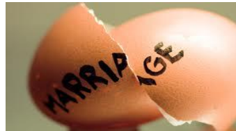
and if it doesn't work out give it another go!