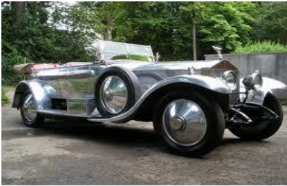
Blind date was the original owner!