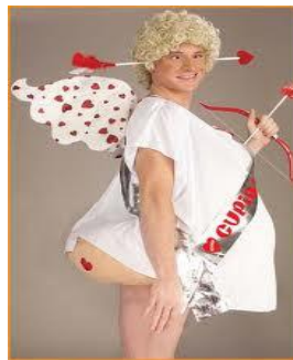
Tonight's costume perhaps!

Funny costumes for Larfmasters to wear was not voted for, shame, shame, shame!