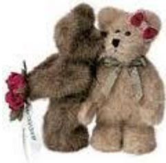
A loving welcome to all our visitors