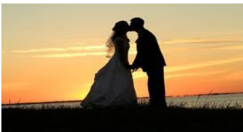
A Wedding Day is one that you never forget