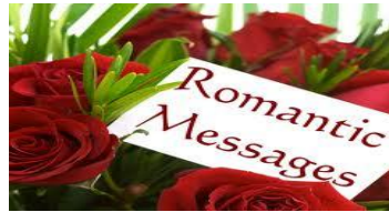
is that a