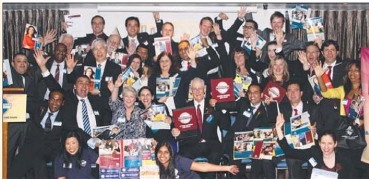
Parramatta Toastmasters Club were selected as winners of the Show Your Brand Contest.